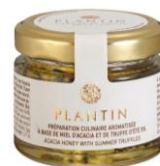
Summer Truffle Acacia Honey