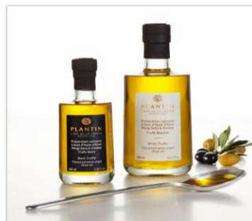
Black Truffle EVOO & White Truffle EVOO