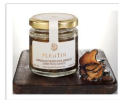
Summer Truffle Carpaccio