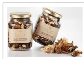
Dry Mix Forest Mushrooms